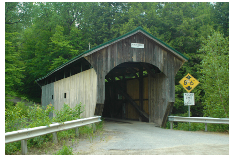
Morgan Bridge, Belvidere