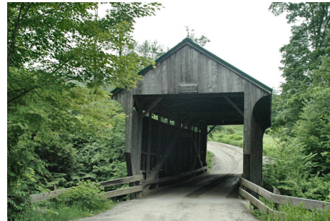
Coddington Hollow Bridge, Waterville