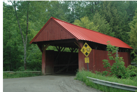
Red Bridge, Morristown