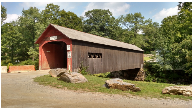
Green River Bridge

A committee will be created to study this alternative in more detail and confer with property owners who would be impacted by choosing this alternative. The town is expected to send out a request for proposals in January 2016 for the alternative it ultimately decides on. Construction is anticipated to start in May 2016.