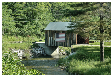
Giorgetti Bridge, Pittsfield