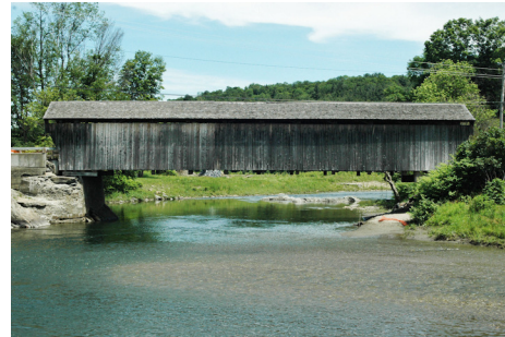
Village Bridge, Waitsfield