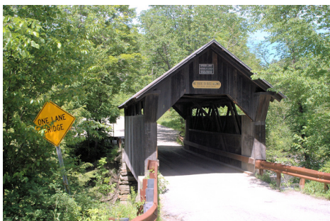
Emily's Bridge. Stowe

Unidentified bridge, "near Berkshire" Monochrome prints of the bridge in winter.