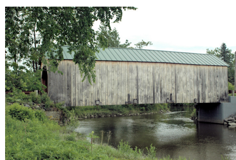
East Fairfield Bridge